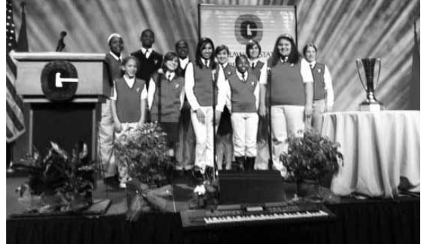
Choristers singing the National Anthem at the Delaware State Chamber of Commerce Annual Dinner.

These generous individuals made it possible for young people, regardless of income, to participate in the Cathedral Choir School's unique after-school experience that helps them achieve their potential as high school graduates—preparing them for college education and beyond—by combining academic tutoring and mentoring with a rich program of vocal music training and performance.