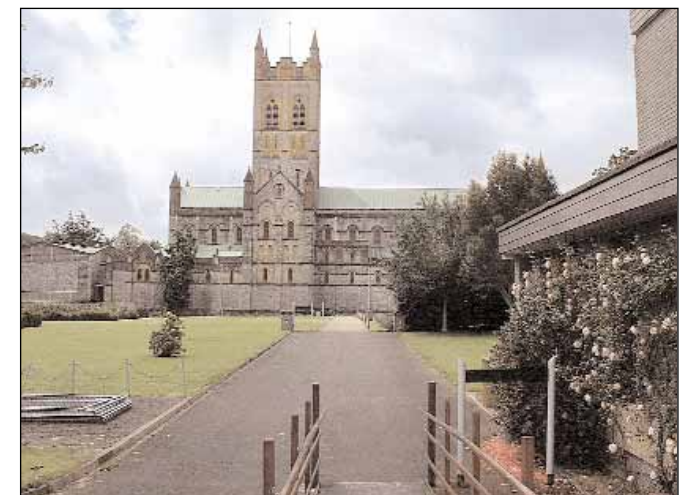
Buckfast Abbey in Devon, where the Choir will sing and also be in residence.