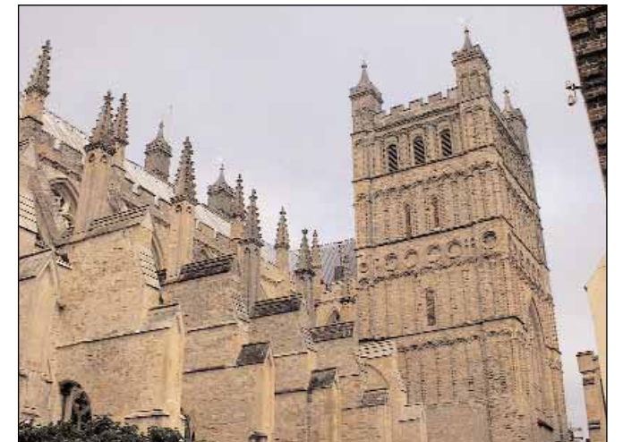
Exeter Cathedral where the Choir will sing six services as the Resident Choir.

In the course of the tour, the Cathedral Choir will have opportunities to sing a variety of liturgies, including several Choral Matins, Choral Evensongs, Choral Eucharists and concerts. In addition to standard English cathedral repertoire, the Choir will present American composers and African-American spirituals.