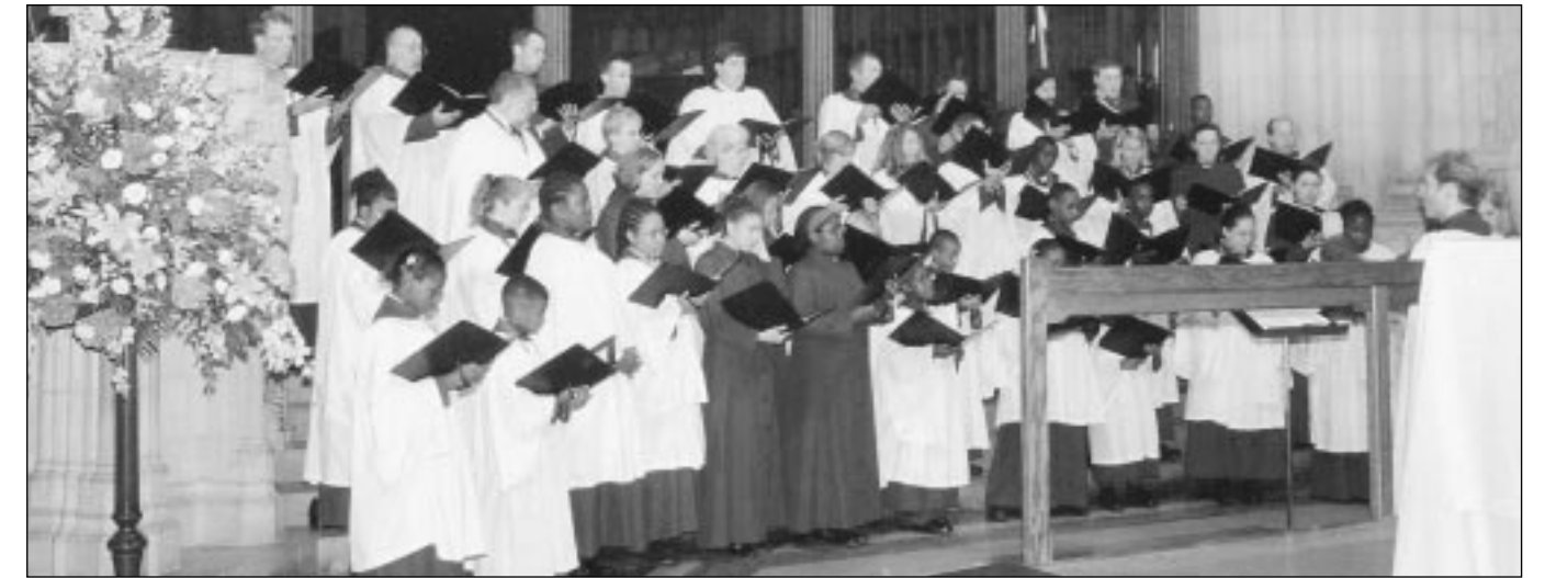
The Cathedral Choir singing at Washington National Cathedral in 2000.